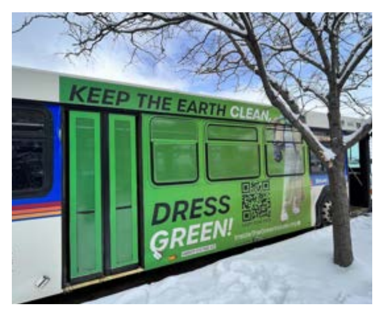
Examples of bus advertisements on Boulder area buses