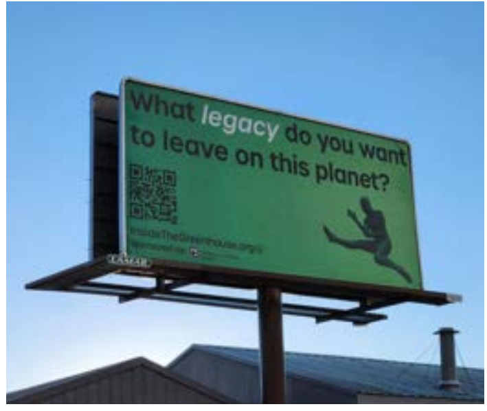
Two billboards near Longmont, Colorado on HWY 199 near I25 and two billboards between Boulder and Golden, Colorado on HWY 93

Fourth, the Inside the Greenhouse team designed 44 individual bus advertisements on Boulder Area Transit as well as Boulder-Denver bus lines. The bus advertisements were a partnership with the <u>City of Boulder</u>, <u>Boulder County</u> and <u>CU Boulder</u>. Half of the advertisements featured messaging about sustainable fashion with linkages to climate change.