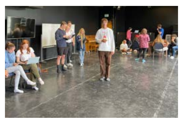
Students practicing their acts.