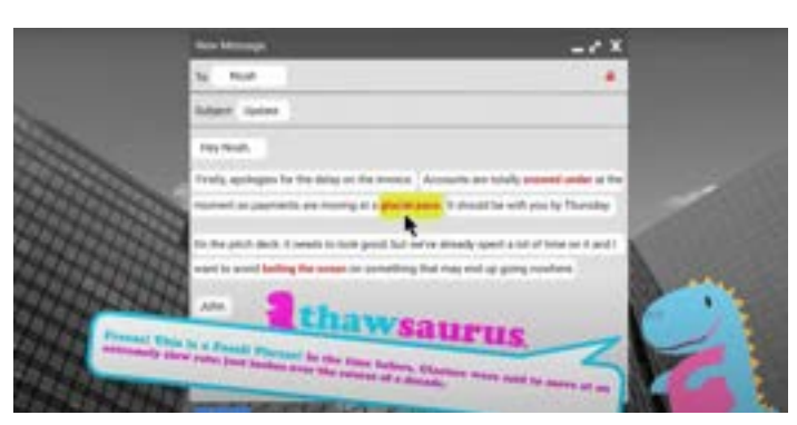
Lughlan Deane, Thawsaurus: <u>Antifreeze your</u> <u>Email</u>