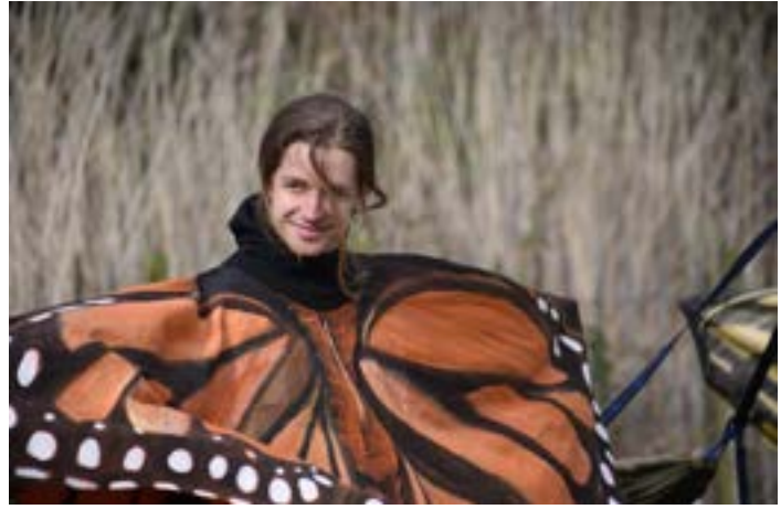
Student of Saint Andrews University in Scotland embodying a Monarch butterfly as part of The Butterfly Affect