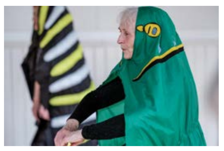
Participant in The Butterfly Affect in Cork Ireland as a Western Tiger Swallowtail caterpillar