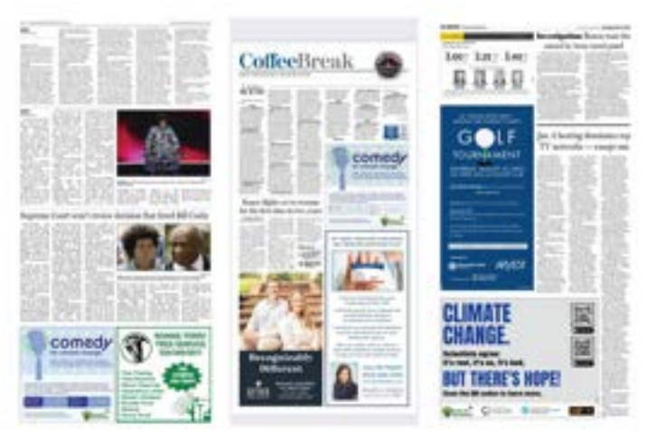
Advertisements in the Selma (Alabama) Times Journal, Brunswick (Georgia) Times Journal, and Harrison (Arkansas) Daily Times

The Harrison Daily Times advertisement was placed with partners from the <u>Yale University</u> <u>Program on Climate Communication</u>, the <u>George Mason University Center for Climate</u> <u>Change Communication</u>, the <u>Netflix Don't Look</u> <u>Up climate platform</u> and <u>CU Boulder</u>.